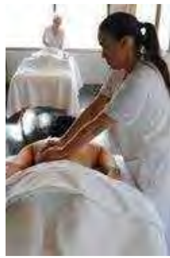
Image: Elizabeth Grady students give and receive therapeutic massage