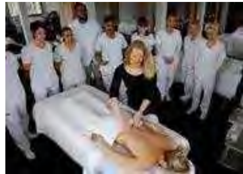
Image: Elizabeth Grady instructor demonstrates massage technique