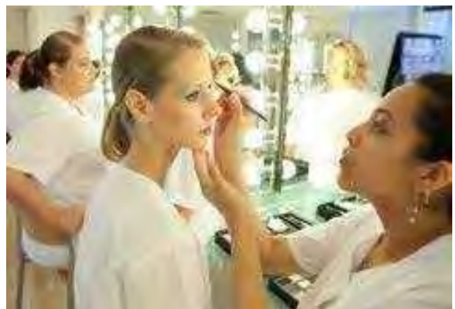
Image: Student applies brow powder to classmate