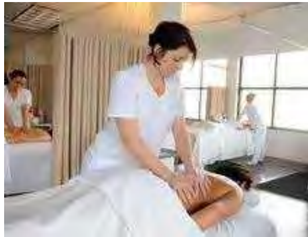
Image: Elizabeth Grady students give and receive therapeutic massage