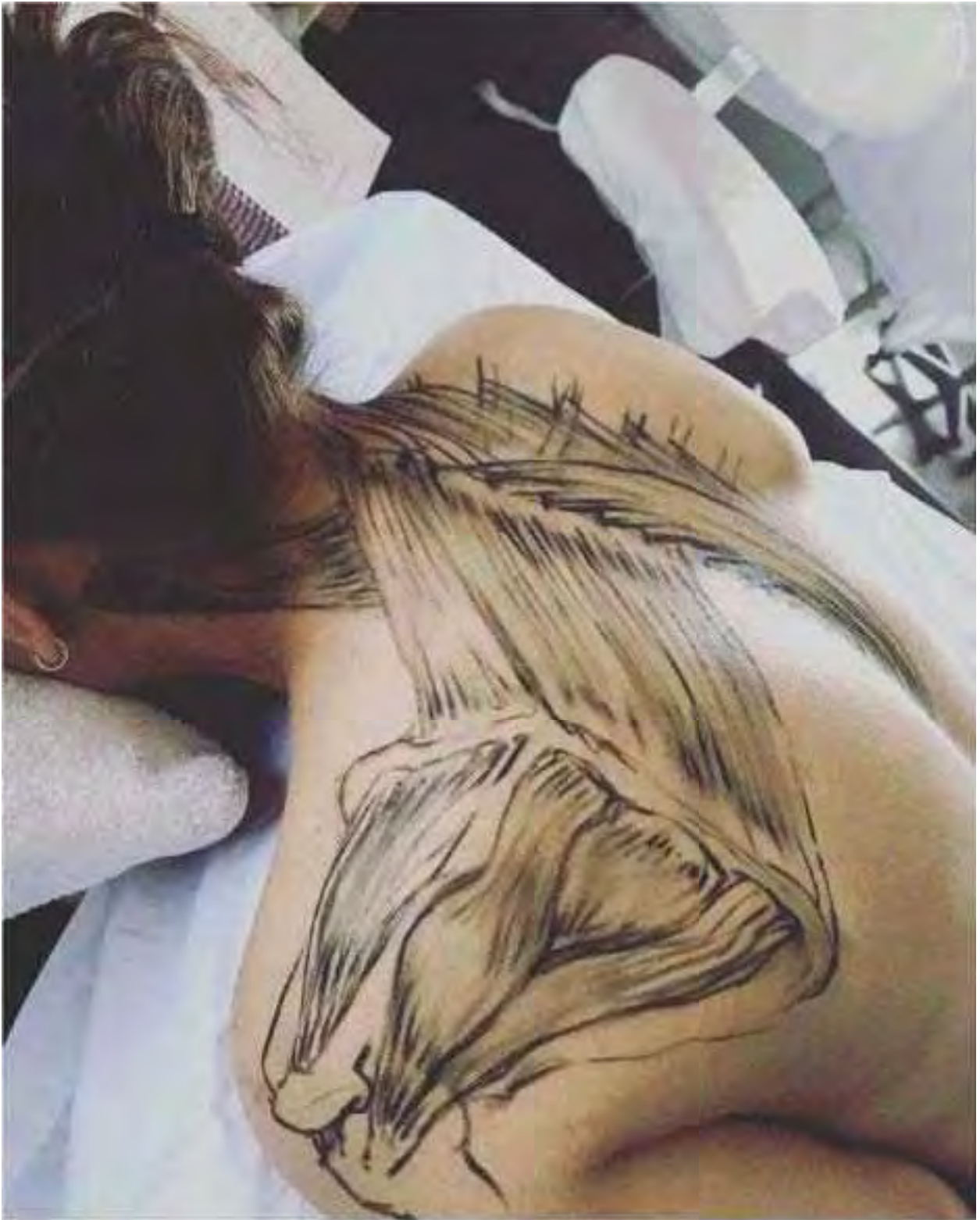
Image: Elizabeth Grady student draws the muscles during class