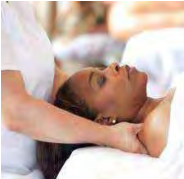
Image: Elizabeth Grady Esthetician Program graduate participating in the Massage Therapy program receives massage.

Career opportunities range from entry-level to business ownership depending upon past professional experience, education, and individual goals.