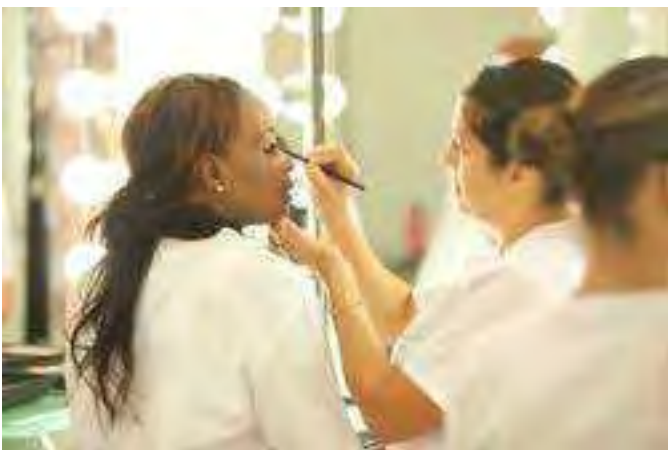
Image: Student applies eyeshadow to classmate

Students choosing to enroll in the 900-hour advanced esthetics program must meet all 600-hour program completion requirements prior to continuing with the additional 300 advanced educational hours. Additionally, please note that hours of training completed beyond the 600-hour minimum requirement shall be considered as additional, advanced training. Although students may find the added knowledge and skills beneficial to their careers, the additional hours do not lead to any type of advanced degree or license. Very few states differentiate levels of licensure in the field of esthetics.