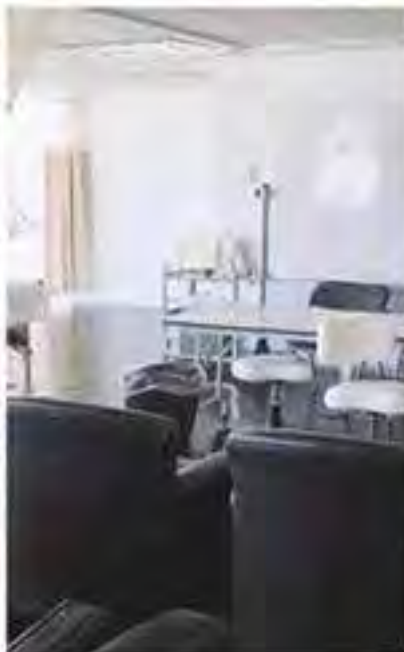
Image: Massage Therapy Lecture classroom