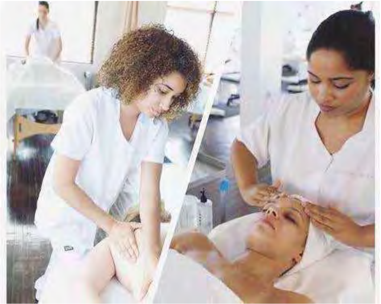
Image: Elizabeth Grady students give and receive Therapeutic massage