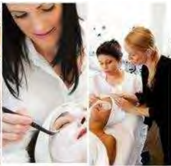
Image: applying a mask during a facial