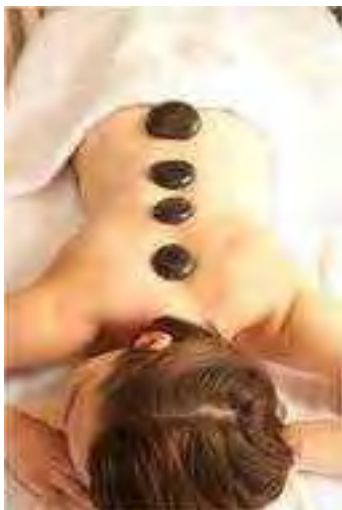
Image: Client receives hot stone massage

The Elizabeth Grady School will assist in resume preparation, job interviewing skills, and job placement. The Elizabeth Grady School does not guarantee placement. Additionally, the Elizabeth Grady School maintains ongoing job listings for graduates and alumnae.