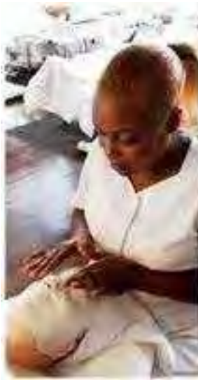
Image: Student performing facial massage.