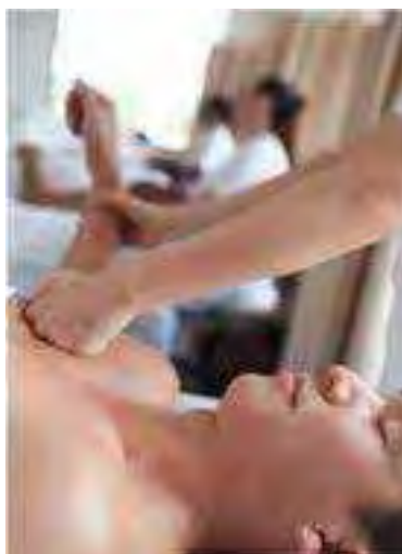
Image: Elizabeth Grady students give and receive therapeutic massage