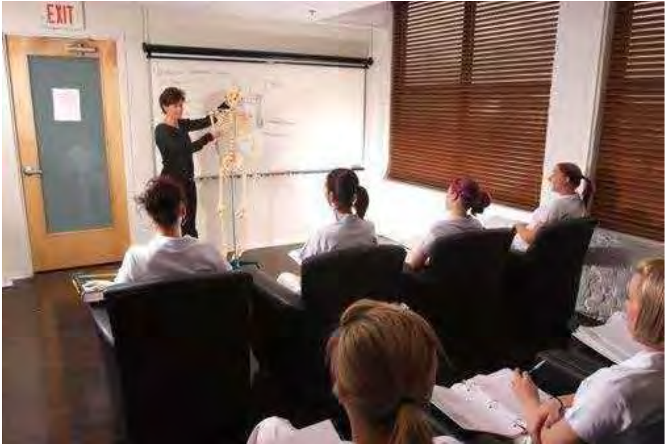
Image: Students learn skeletal anatomy.