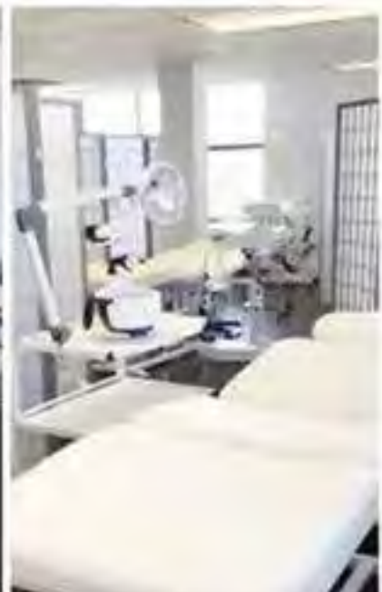
Image: Esthetics Practical classroom