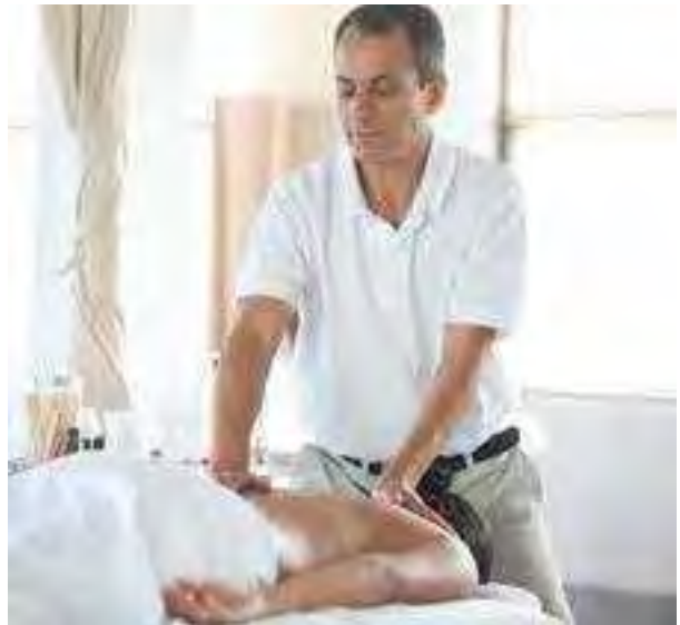
Image: Massage Program students give and receive therapeutic body massage.