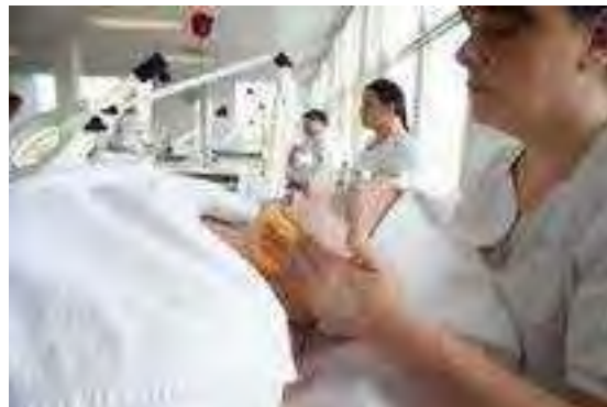
Image: Student removes client's finishing mask during facial