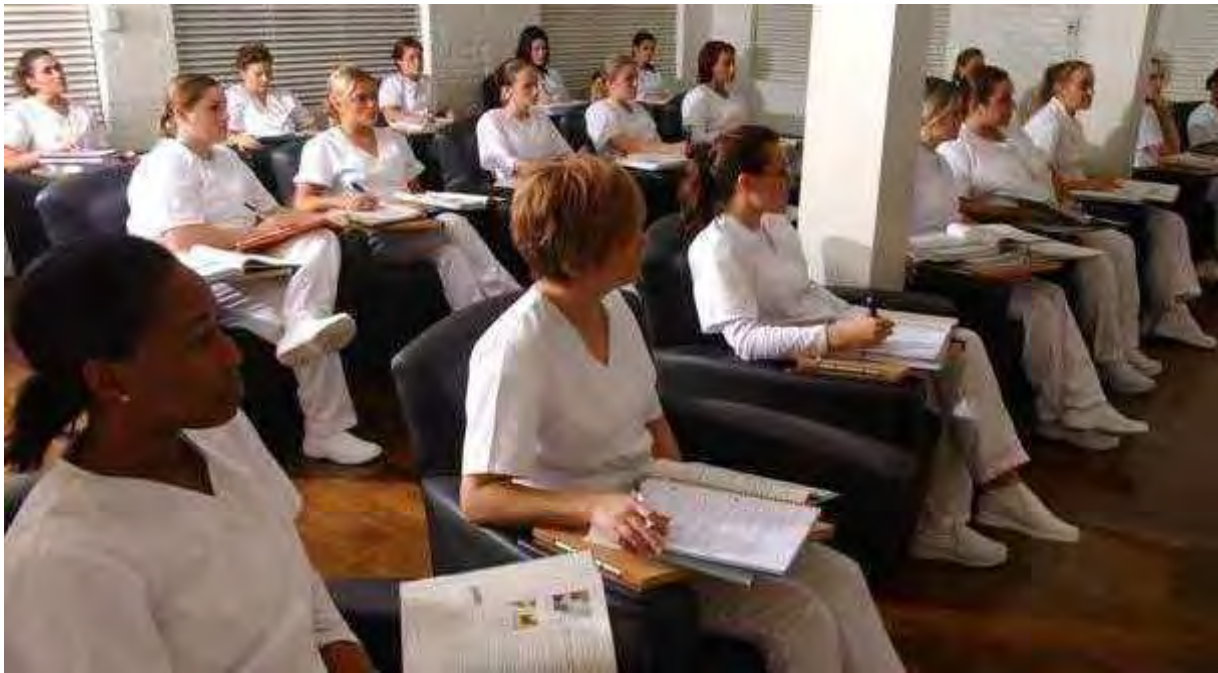
Image: Students learn about the cardiovascular system and its importance to skin and health in Theory class

The Elizabeth Grady School is required to provide access to student records to the National Accrediting Commission of Career Arts and Sciences (NACCAS) and to other agencies in relationship to school accreditation and licensing.