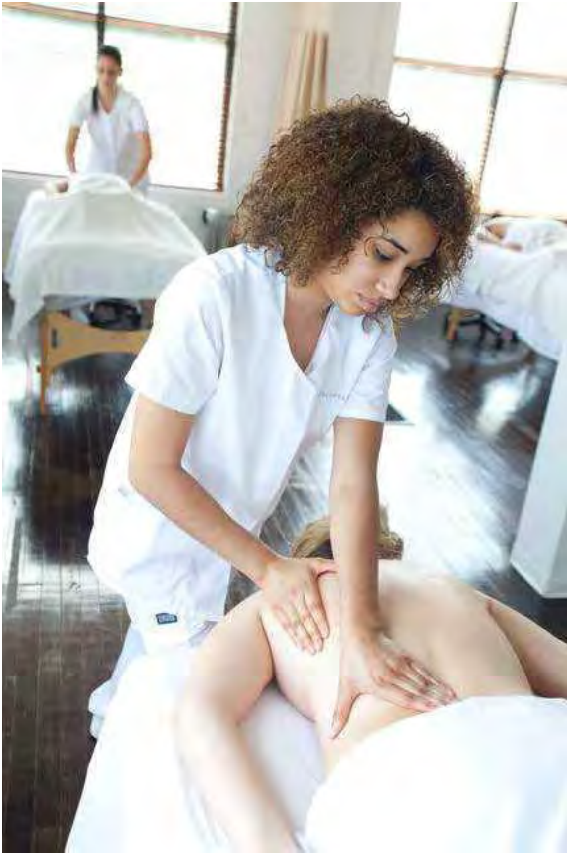
Image: Elizabeth Grady students give and receive massage