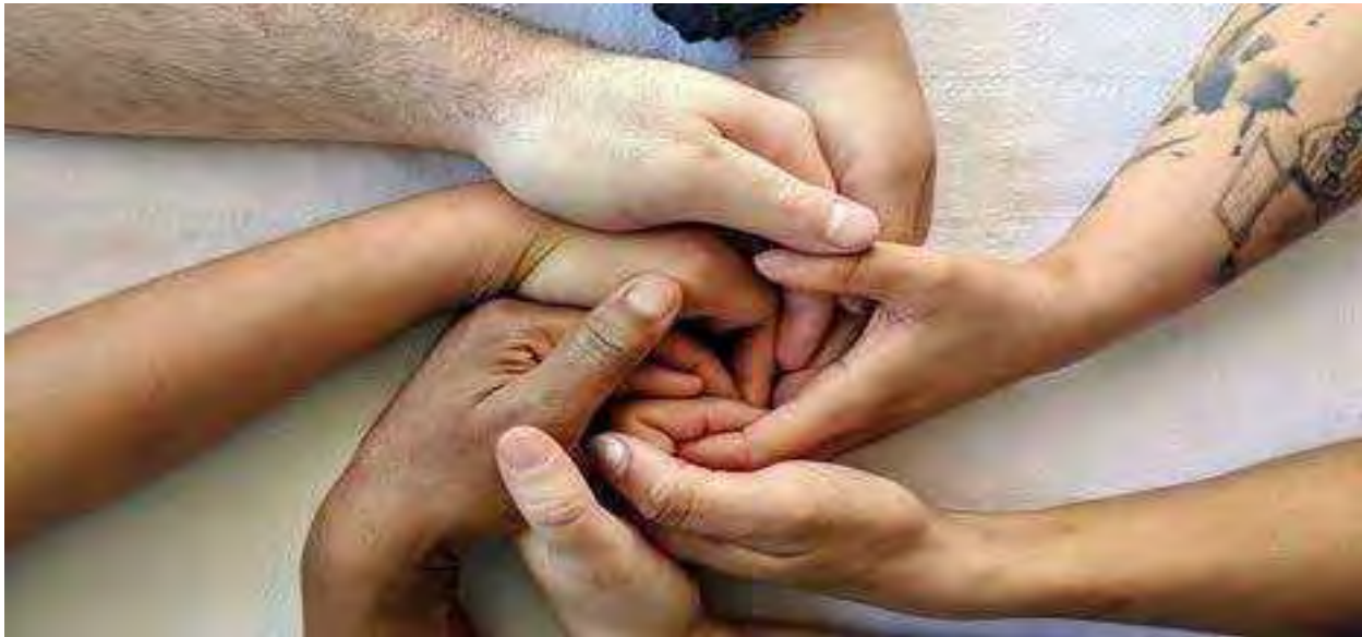
Image: Elizabeth Grady Massage Therapy Students display the tools of their craft.