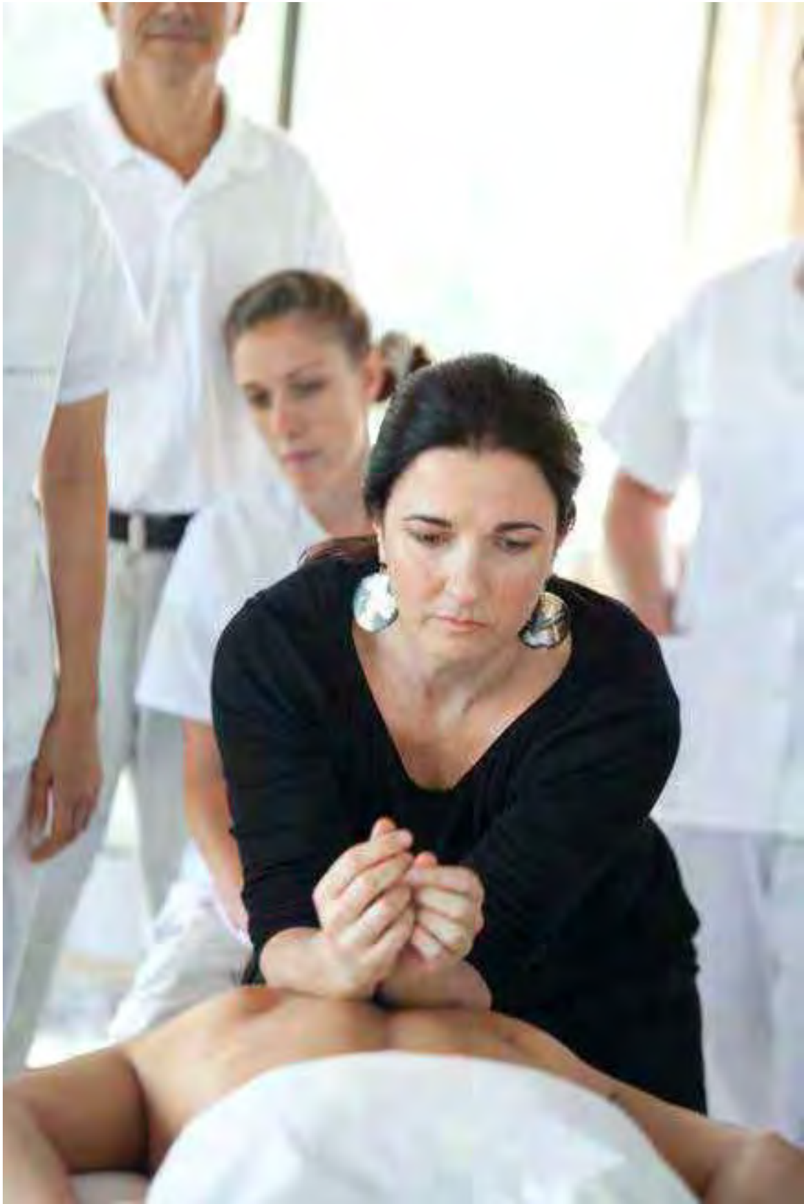
Elizabeth Grady instructor demonstrates massage technique