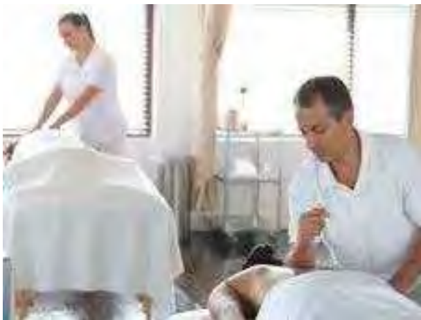
Image: Elizabeth Grady students give and receive therapeutic massage