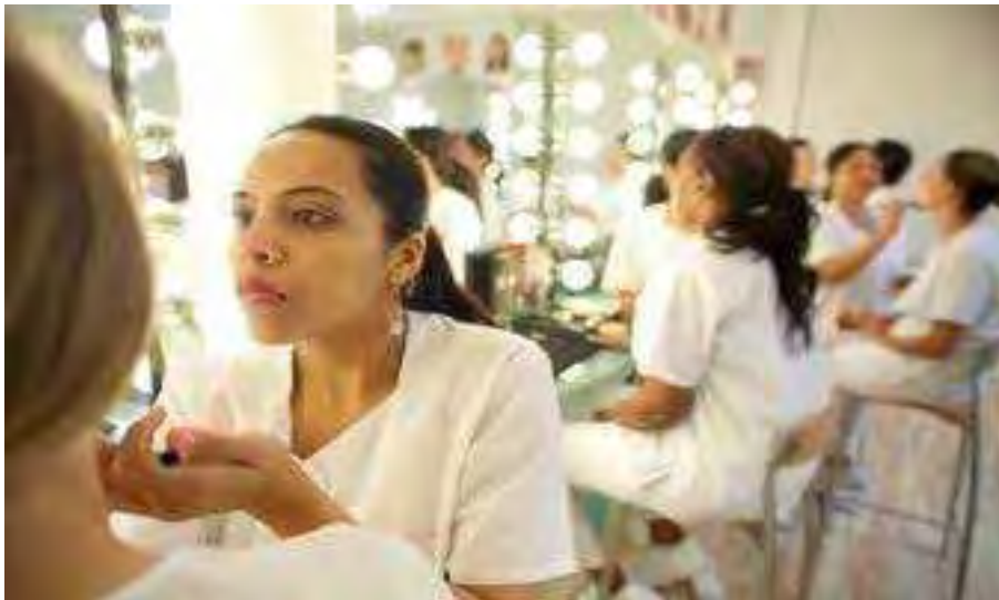
Image: Esthetician student applies Makeup to classmate