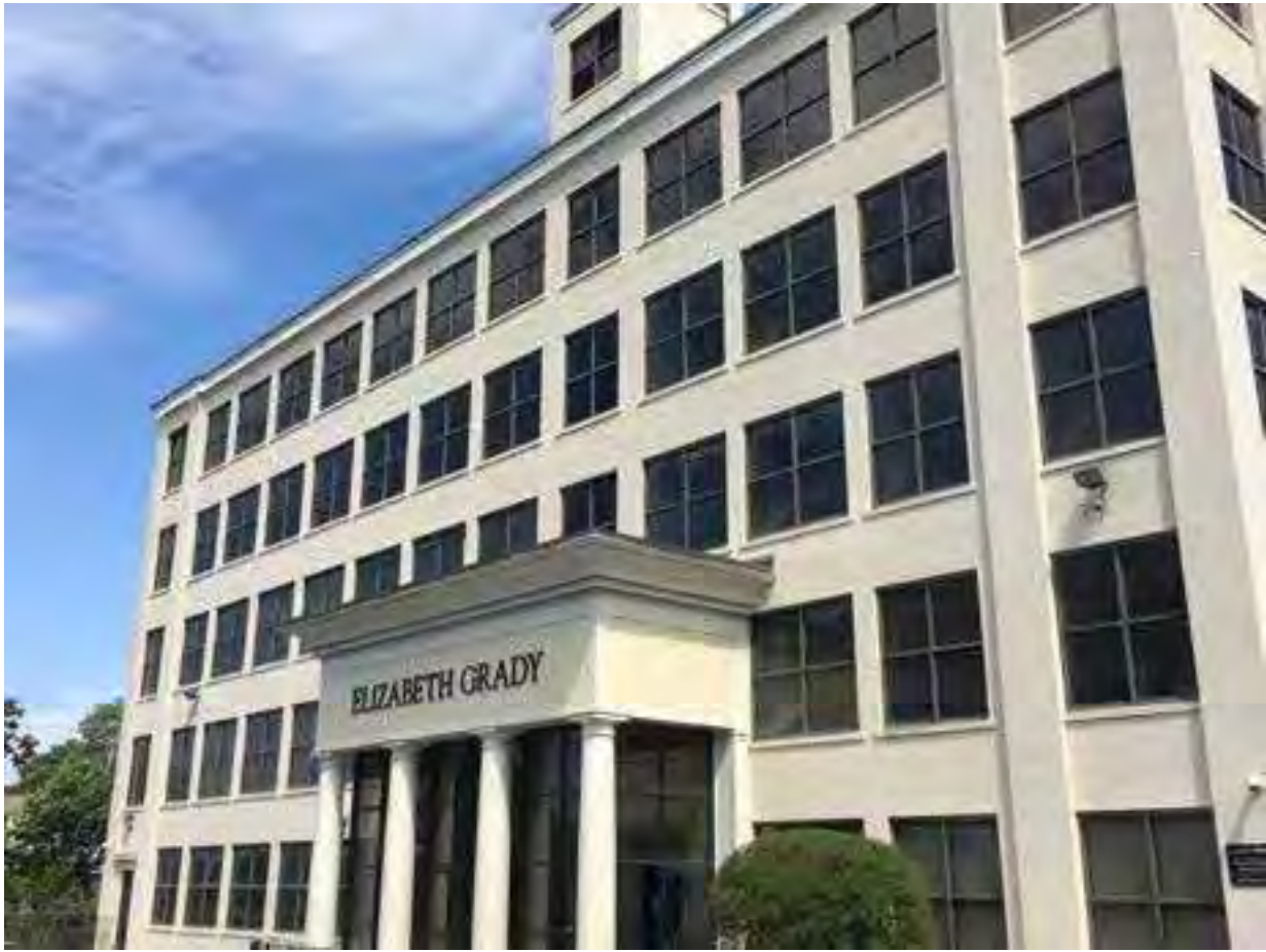
Image: The Elizabeth Grady School Building.