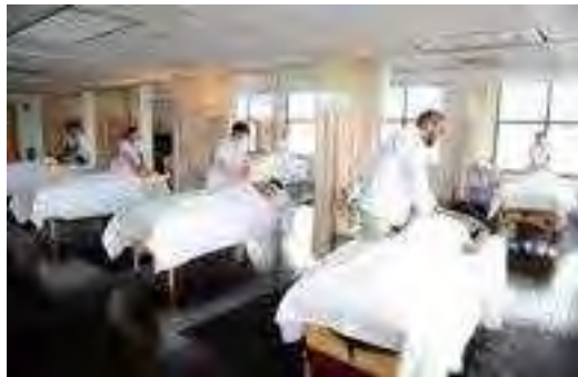
Image: Elizabeth Grady students give and receive therapeutic massage